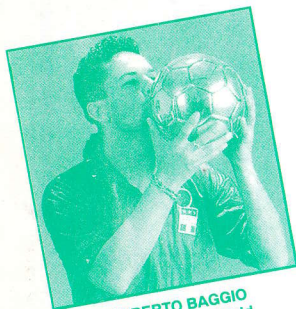
ROBERTO BAGGIO European and World Footballer of the Year