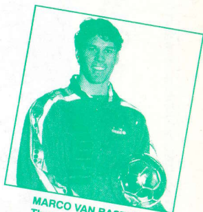
MARCO VAN BASTEN Three times European Footballer of the Year